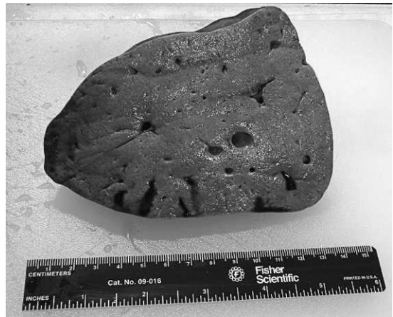
Figure 2. Cross-section of the liver in a juvenile harbor porpoise ( Phocoena phocoena ) with severe hepatic lipidosis.

Enterococcus spp. are Gram-positive, facultatively anaerobic organisms that are found in the intestinal tract of most mammals, including harbor